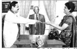
Daily Mirror - Friday November 2, 2012

DailyFT - Thursday May 19, 2011 Her Lordship! First Woman Chief Justice sworn in