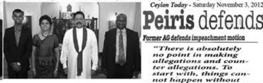
A bugle call for all likeminded 'protectors' of the Rule of Law

Ceylon Today - Saturday November 3, 2012 So... where is "the law"?