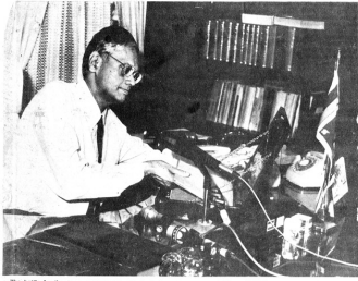
The battle for the cabinet... Prof. G. L. Peiris, Finance Minister, is seen in a meeting with other cabinet members.